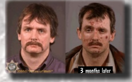
3 months later

Brain damage lasts for years even after the user stops. Other side effects are paranoia, hallucinations, seizures and memory loss