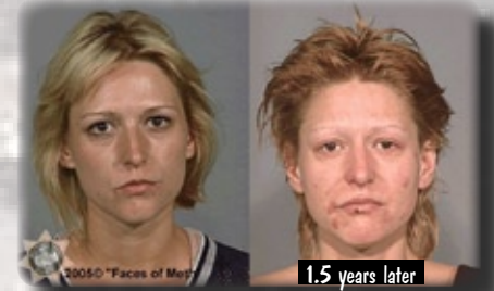
1.5 years later