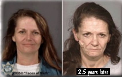
2.5 years later