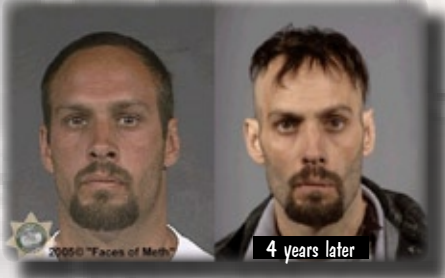
4 years later